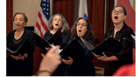
Community members mingled throughout campus and Kol Haneshama performed during Welcome Ceremony