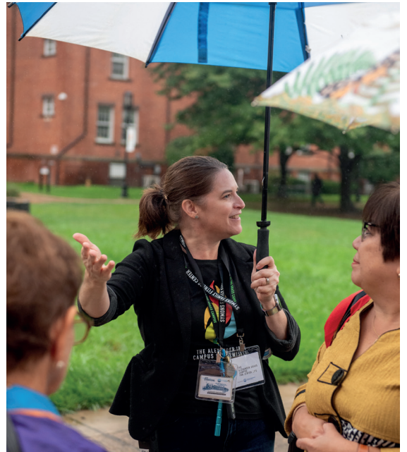
A welcome ceremony kept community members dry and introduced key Grass Campus figures ahead of tours across the campus.