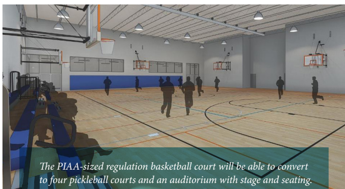
The PIAA-sized regulation basketball court will be able to convert to four pickleball courts and an auditorium with stage and seating.